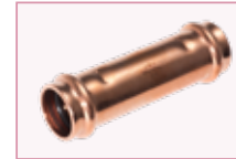
Long Coupler 1/4" to 1.1/8"