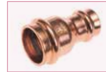
Reducing Coupler 3/8" x 1/4" to 1.1/8" x 1"