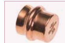
Stop End 1/4" to 1.1/8"