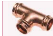
Equal Tee 1/4" to 1.1/8"