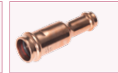
Long Reducing Coupler 3/8" x 1/4" to 1" x 5/8"