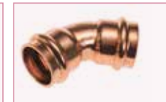
45° Obtuse Elbow 1/4" to 1.1/8"