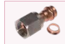
SAE45 Stainless Flare - Stainless Nut - Copper Washer 1/4" x 1/4" to 3/4" x 3/4"