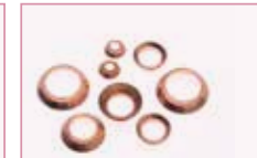
Copper Flare Washer 1/4" to 3/4"