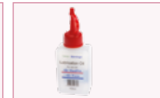
Press Fitting Lubricant (100ml)