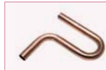
Suction Line P-Trap 5/8" to 1 1/8"