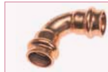
90° Bend 1/4" to 1.1/8"