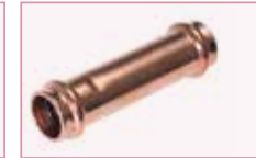
Long Repair Coupler 1/4" to 1.1/8"