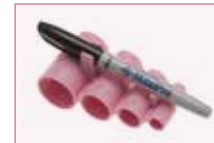
Depth Gauge & Pen