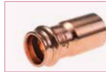
Fitting Reducer 3/8" x 1/4" to 1.1/8" x 7/8"