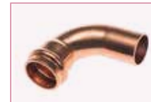
90° Street Bend 3/8" to 1.1/8"