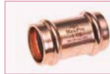
Straight Coupler 1/4" to 1.1/8"